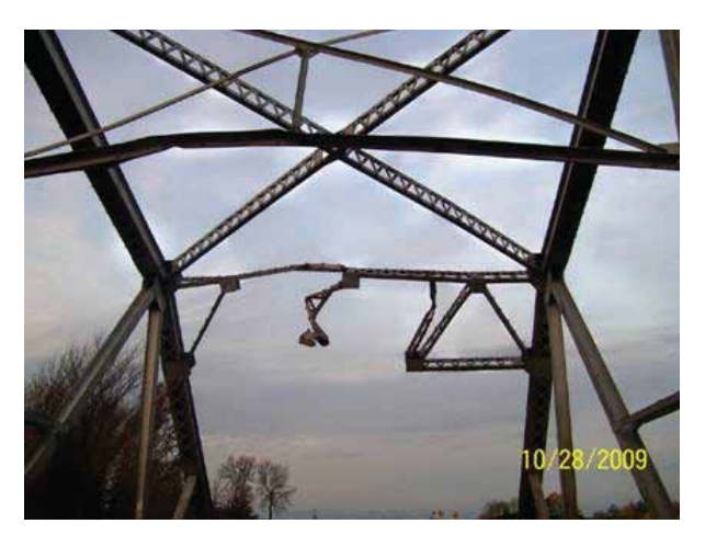
Bridge damaged by raised truck box near Thompson, ND; on the Red River, 2009

"It's not the first time that an elevator exit door has been hit, it has happened all over the Valley. Some hits are worse than others."