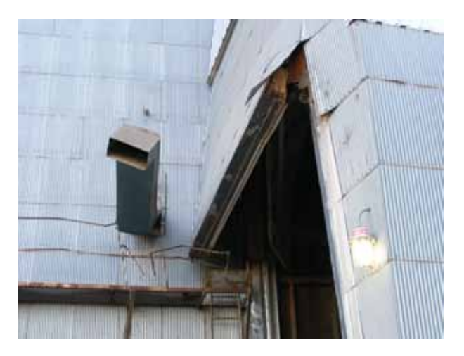
Raised truck box damages elevator door in Alvarado, MN 2009

Have you ever seen the trail of grain leading to the pile of grain along the side of the road and chuckled, thinking "I'm glad that wasn't me?" Or maybe you didn't laugh, because it was you.